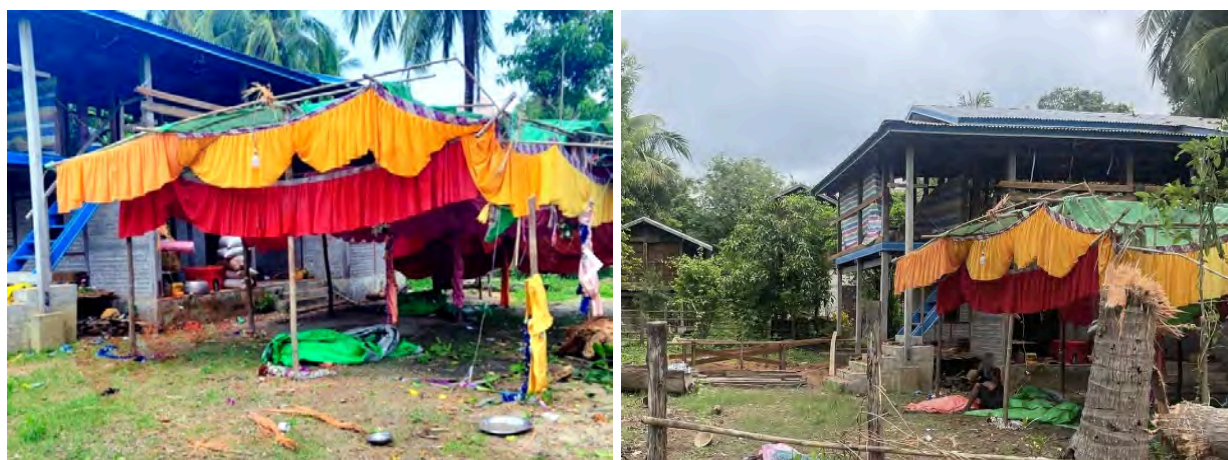
Figure 8: Decorative pandals such as these at the site of the alleged attack are often used for special events such as weddings.

The victims' are dressed in plain clothes. While this does not indicate a special occasion or military operation (figure 9), the small rural village is not a wealthy area, and thus, people may not wear clothing considered 'special attire' even during a special occasion.