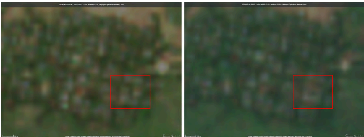
Figure 7: Comparison of Sentinel-2 imagery on 1 (left) and 6 June 2024 (right).

Sentinel-2 imagery of the incident location in Ma Taw village is available for 1 , 3 and 6 June 2024 ; however, the location is covered by clouds in imagery from 3 June. Sentinel-2 imagery taken on 1 and 6 June 2024, shows changes on the ground at the location in question, shown with the red boxes in figure 7.