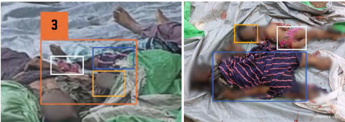
Figure 10: Cross-referencing of imagery appearing to show the body of a child.