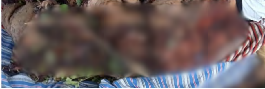
Figure 11: Blurred image of human remains showing high levels of trauma (source: Khit Thit ).