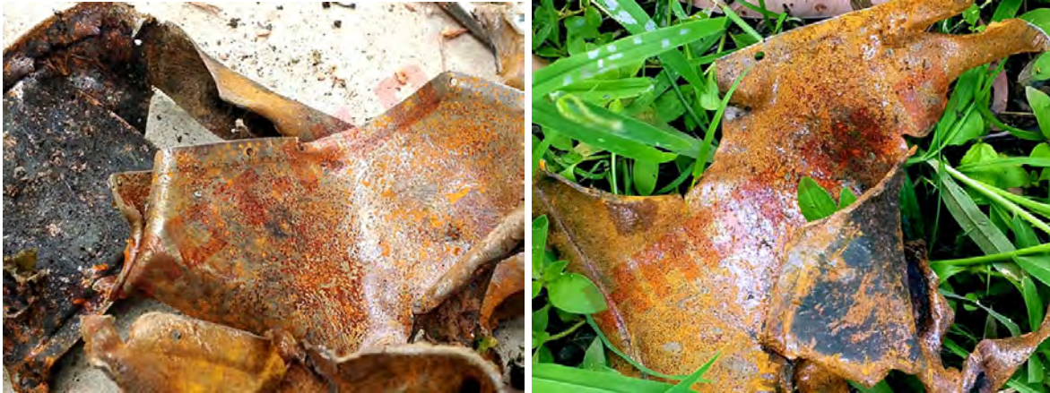
Figure 13: Pieces of used munitions reportedly found at the site of the incident. Myanmar Witness has not been able to geolocate or identify the remnants.

The damage is consistent with that of an airstrike, however, there is no specific evidence confirming if the damage was caused by an airstrike, artillery, mortar, or other form of attack.