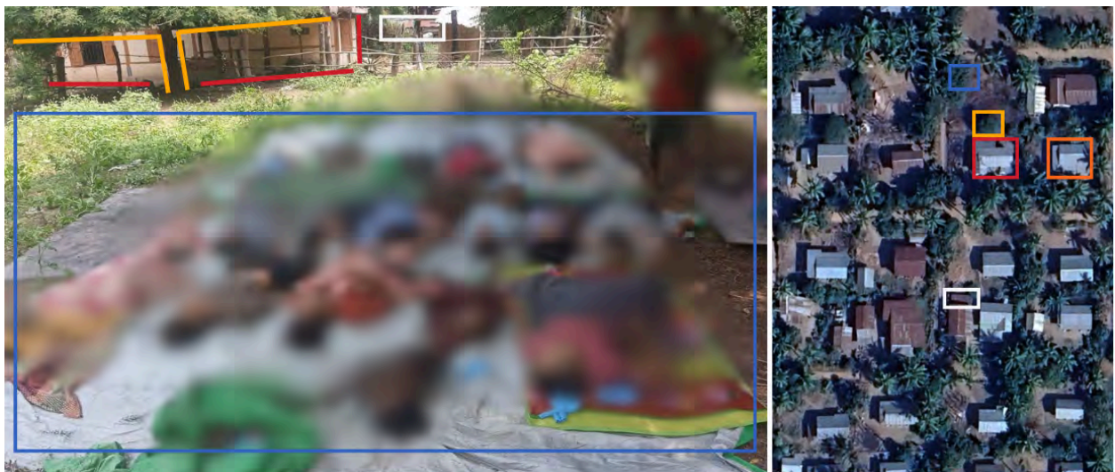
Figure 5: Bodies of fatalities placed together near the location of the pandal (orange box) [22.895135, 94.531034].