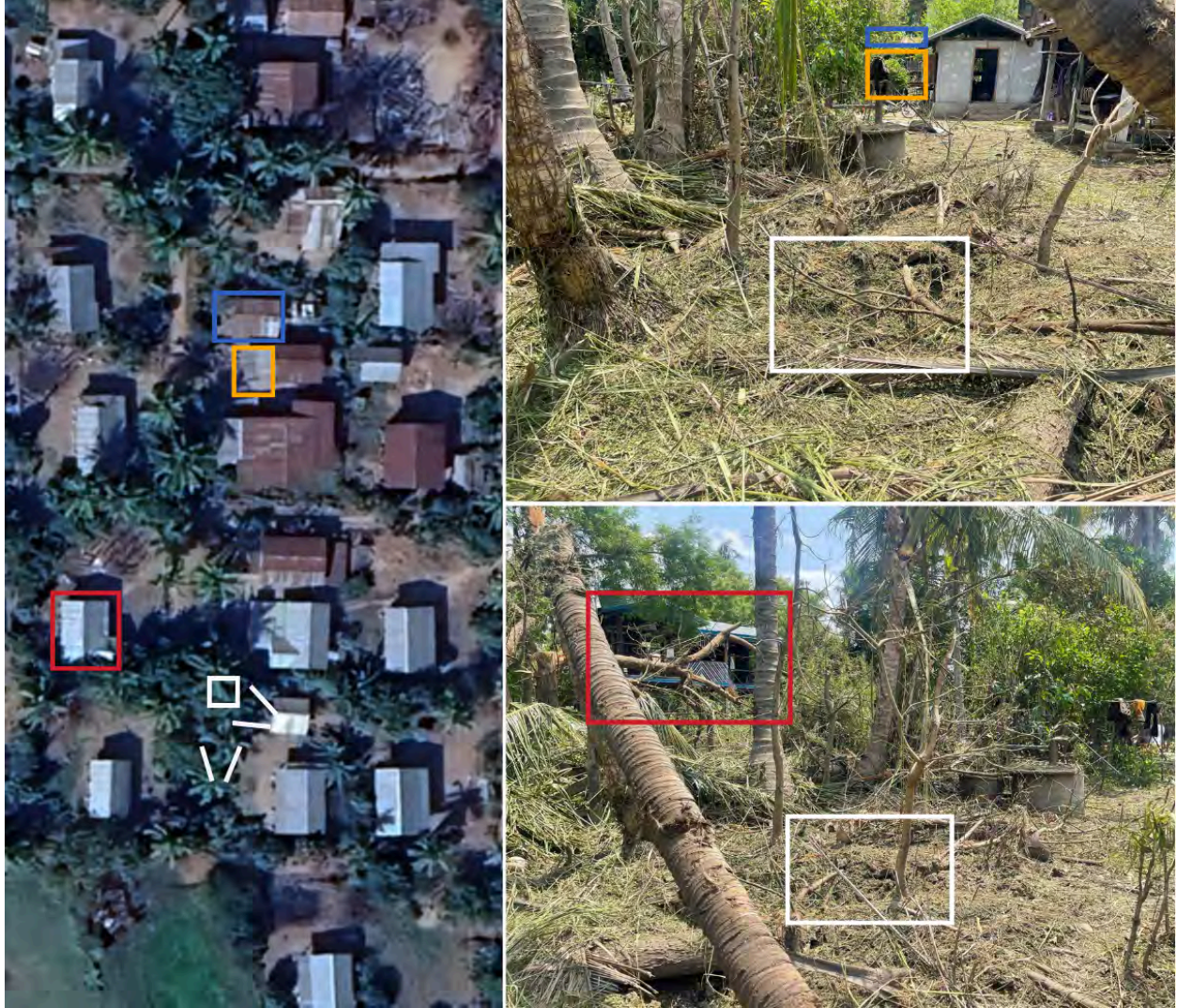
Figure 6: Imagery and satellite imagery of a crater and damaged trees near the possible site of the explosion [22.894357, 94.530979] (source redacted due to safety concerns).