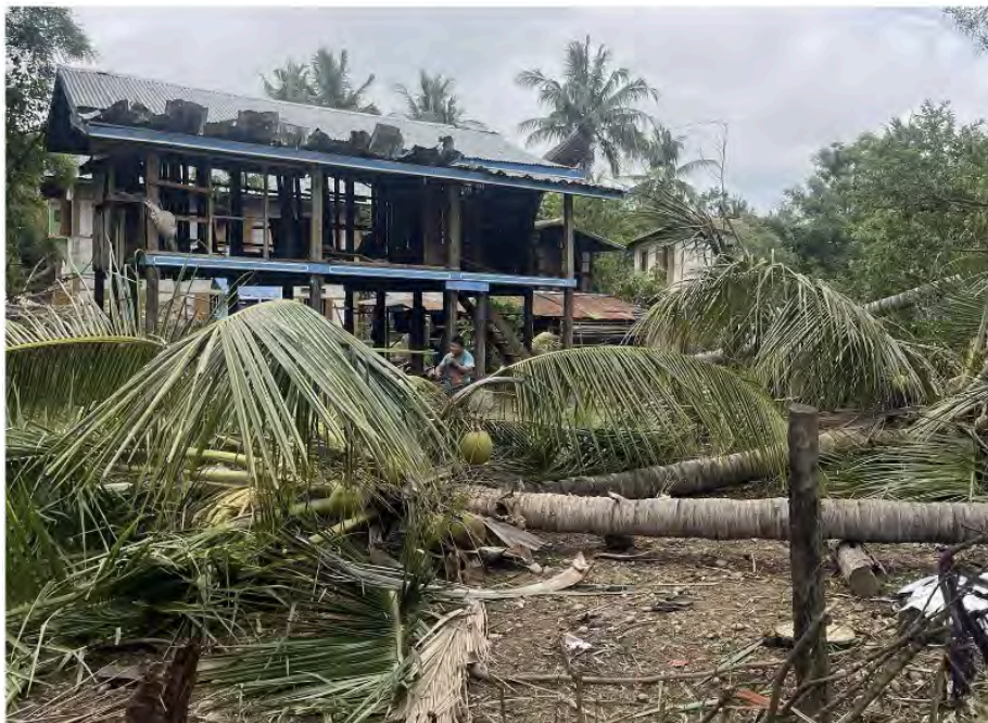
Figure 12: (Top) Damage on the ground (white boxes) indicating a possible crater as a result of one or more explosions (source redacted due to safety concerns). (Bottom) Multiple coconut trees are visible as fallen on the ground. (source: Myanmar Now ).

Detailed forensic analysis by Myanmar Witness reveals evidence of human tissue, blood, internal components and bone fragments in the UGC (figure 11). The casualty count, visible body trauma, and injuries, are consistent with the use of a heavy weapon.