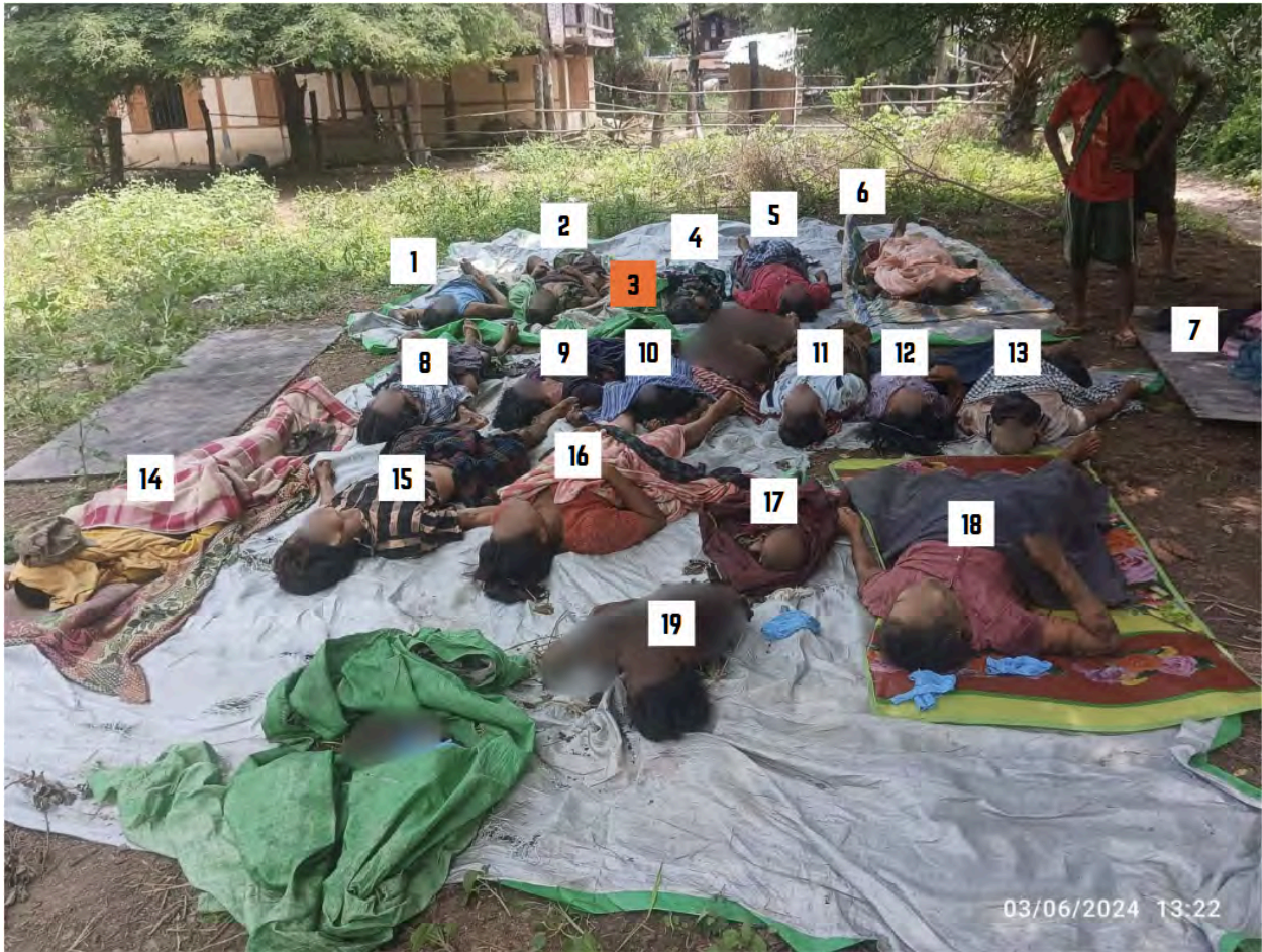
Figure 9: Myanmar Witness identified with a high level of confidence at least 19 separate bodies, including two children labelled 3 (see figure 10 for detailed analysis) and 17.