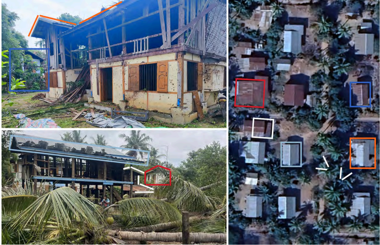
Figure 4: Imagery of buildings west of the pandal and coconut trees heavily damaged [22.894906, 94.531086] and [22.894621, 94.531027].