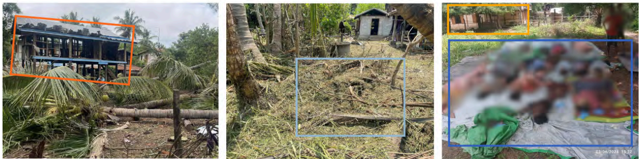
Figure 7: PICINT showing geolocated locations of imagery relating to the incident.