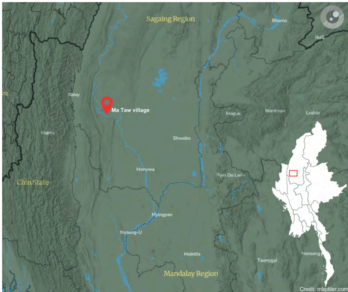
Figure 1: Location of Ma Taw Village, Mingin Township, Sagaing Region, map created by Myanmar Witness

On 3 June 2024, an alleged airstrike and a follow-up mortar strike hit the location of a wedding in Ma Taw (မတော) village, Mingin (မင်းကင်း) township, Sagaing (စင်္ကြံ) region. Reports from multiple sources, including a local People's Defence Force (PDF) group (source redacted due to safety concerns), media outlets such as Myanmar Now , and pro-State Administration Council (SAC) accounts such as Myanma Honor , claimed it was the wedding of a PDF leader. The sources also allege that there was no known active fighting in the area on the date of the incident. The airstrike reportedly occurred while people were gathering at the building hosting the wedding ceremony and another nearby building where food was being served, killing up to 30 people and wounding around 60. However, exact numbers vary across different sources ( Khit Thit , Myanma Honor ). Up to seven children were reportedly among the fatalities ( Khit Thit , Myanmar Now ).